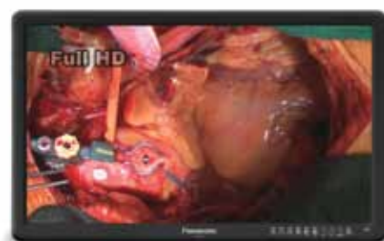
3D images can be collaboratively viewed by the surgical team.

Panasonic's medical-grade 3D monitor uses the Xpol circular polarizing technology to produce a 3D image instead of the usual linear polarization solutions. Panasonic's passive circular polarizing glasses and the Xpol system maintain the stereoscopic effect even when the surgeon's head is tilted to the left or right—a benefit linear polarization solutions cannot offer. This feature allows for a natural viewing experience. For increased flexibility, the device also supports multiple 3D formats and inputs and can even reduce surgeons' eye fatigue when viewing content.