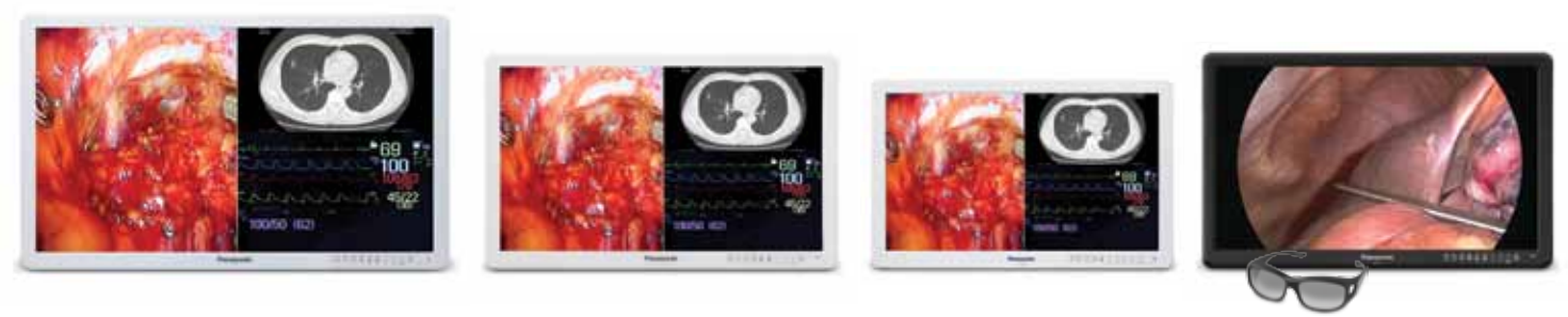
37" CLASS EJ-MLA37U-W

Panasonic HD medical-grade monitors exceed the highest industry standards for electrical safety and sanitization. The surgical displays are FDA Class 1 rated (UL 60601-1, CAN/USA C22.2 601.1, IEC 60601-1-2). They have an Antimicrobial Surface and can be sanitized with a variety of disinfectant wipes. The EJ-MLA26U is fully IPX2 rated. They meet VESA Mount Standards for mounting to boom arms, or on a wall, a surgical cart or a workstation.