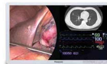
Easily fine-tune picture quality for each image displayed.

Panasonic medical-grade monitors support HD-SDI inputs, DVI inputs, plus analog input—eliminating the need to purchase optional input board(s). Additional features include surgical video and radiology graphics imaging and 178° wide angle viewing.